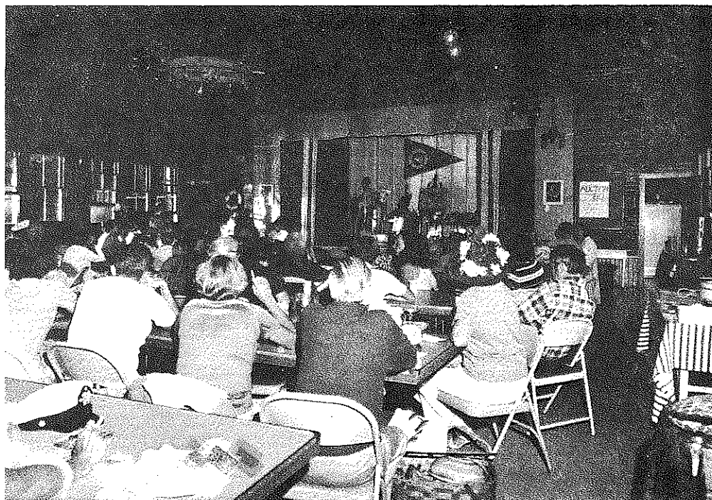
"Going - Going - Gone!" - the O.T.Y.C. Benefit Auction