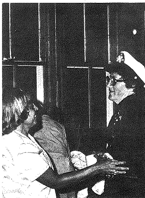
New Commodore tries on her hat for size