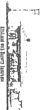
Located in the Depot/Northport, Michigan 49670