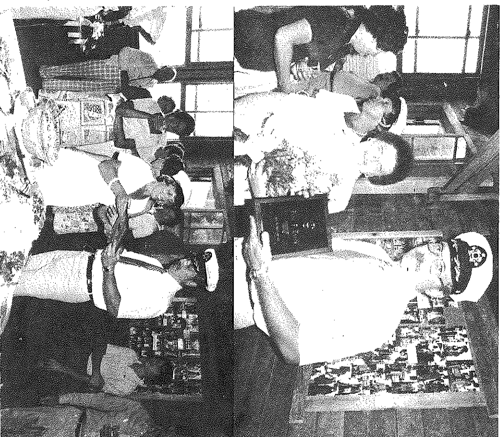
At The Commodore's Reception