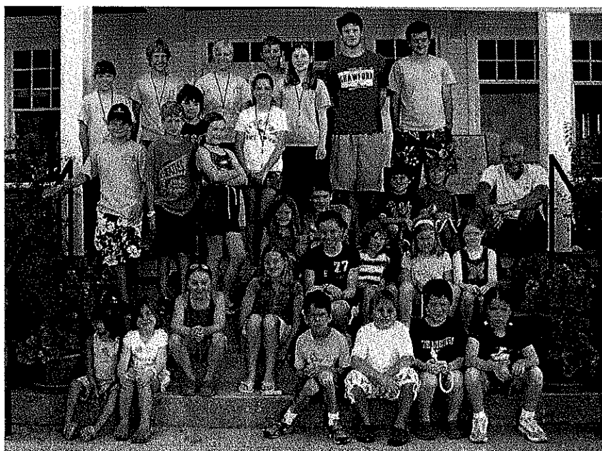
Campers and Instructors for Week 5

I am most appreciative that you are sending your children and grandchildren to the camp again.