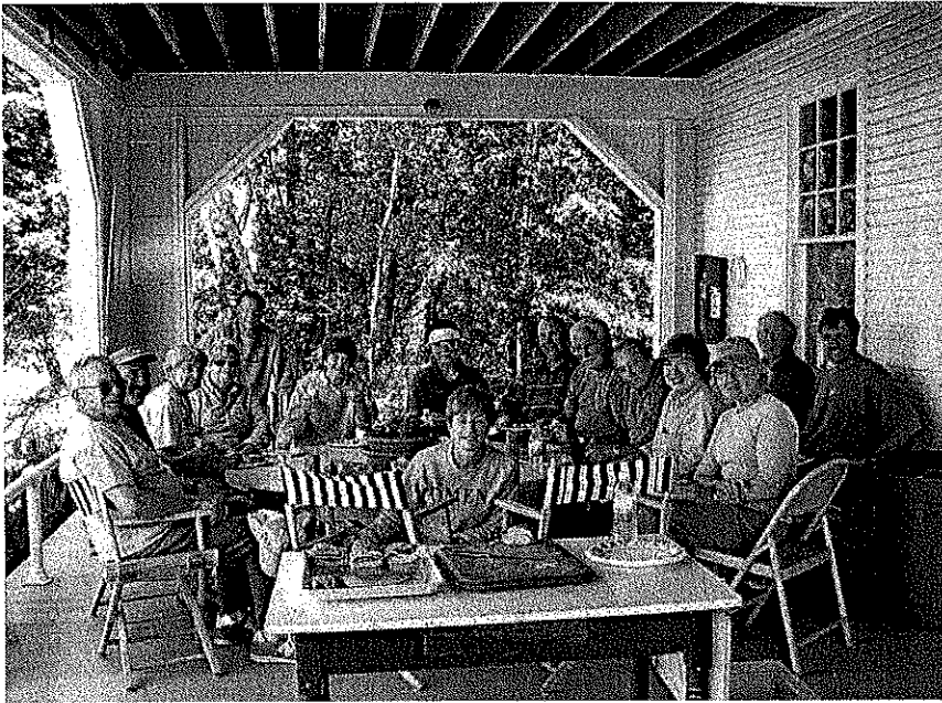
OTYC Spring Clean-up Crew