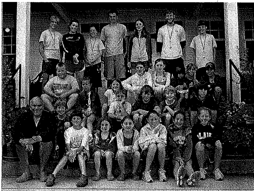
Campers and Instructors for Week 2